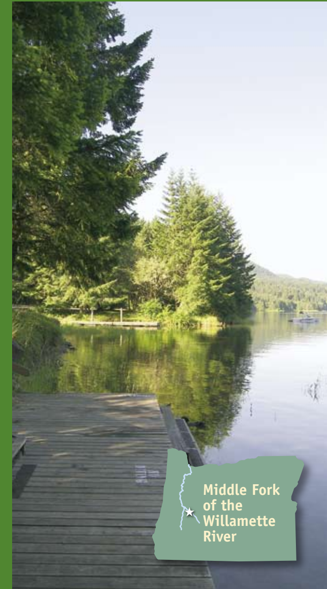
Middle Fork of the Willamette River