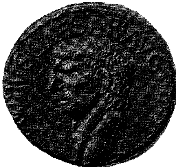
Figure 1. A coin image of Claudius I depicting marked hypertrophy of the anterior neck musculature.

More clinical information can be gleaned from the writings of Lucius Annaeus Seneca (“the younger Seneca”)